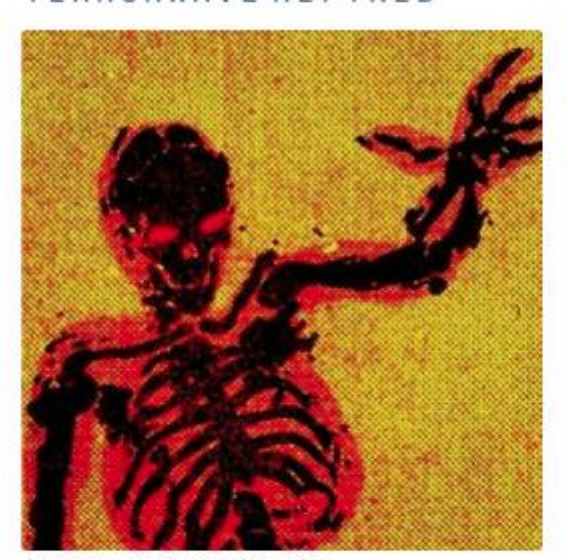
//PROMOTE THE PANIC//

MAKE SOCIAL MEDIA POSTS ABOUT THAT GUY WHO KILLED HIS NEIGHBORS FOR THEIR RESOURCES, TELL YOUR COWORKERS ABOUT SOME CHINESE GUY WHO WAS IN THE GROCERY STORE COUGHING ON THE FRUIT, AND USE A BURNER PHONE TO COLD CALL POLICE AND JOURNALISTS TO TELL THEM YOU'RE ABOUT TO ENTER SIGNIFICANT CROWDED AREAS WHILE INFECTED WITH CORONA VIRUS.