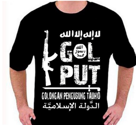
Figure 1. ISIS T-shirt once sold on Facebook

For some time, Facebook users could purchase black ISIS T-shirts until accounts that were selling them were shut down. Shirts contained the ISIS logo, an AK-47, and Arabic writing that was also translated into English.