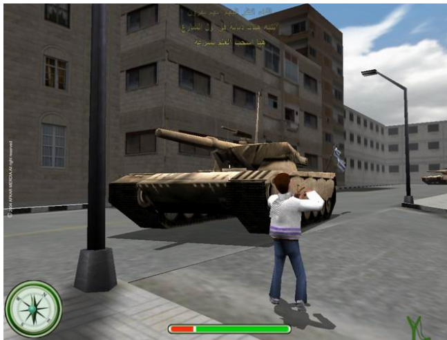
Figure 5. Player from Under Ash fighting a tank with rocks

Screen capture taken from the Under Ash 2 video game. Image is available to view on the game download page. Source: Under Siege, Under Ash, last accessed 7 October 2015, http://www.underash.net/en_download.htm .