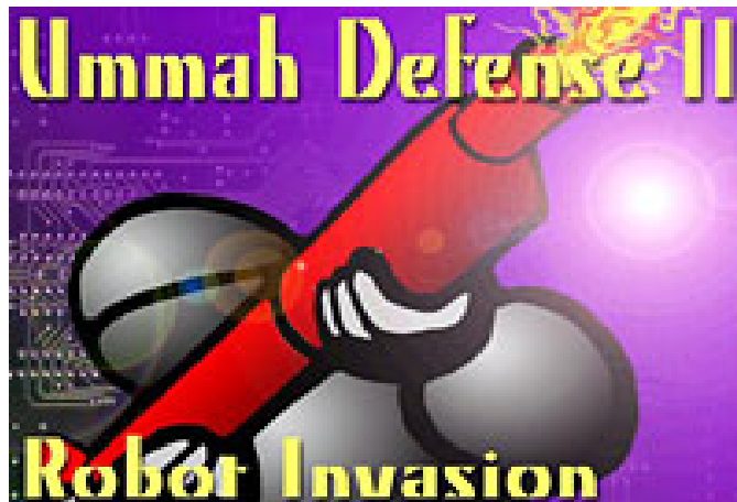
Figure 7. Al Qaeda video game entitled Ummah Defense II