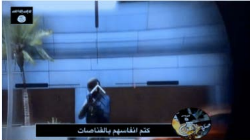
Figure 9. ISIS video game

An image from ISIS' first-person shooter video game. Source: "The Islamic State of Iraq and the Levant: Branding, Leadership Culture, and Lethal Attraction," National Consortium for the Study of Terrorism and Responses to Terrorism , November 2014, 32.