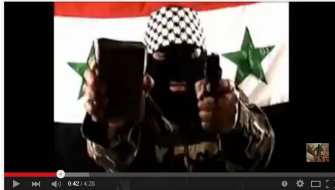
Figure 2. Masked Man with Quran and gun from Dirty Kuffar video

Screen capture taken from the Dirty Kuffar video.