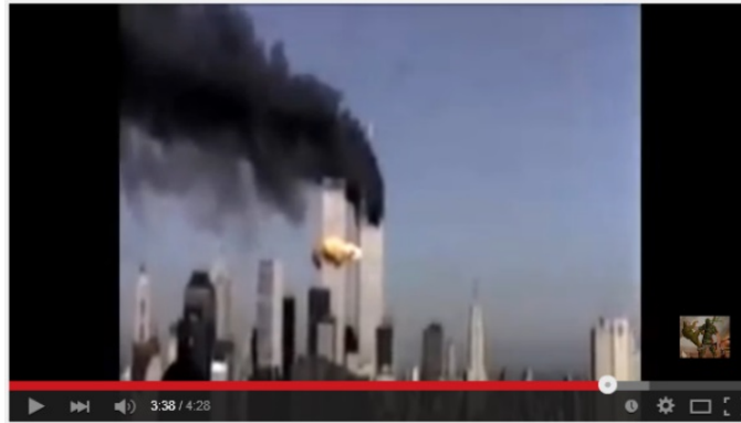
Figure 3. World Trade Center bombing praised in Dirty Kuffar video

Screen capture taken from the Dirty Kuffar video.