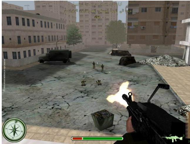
Figure 4. Player from Under Ash assaulting military forces

Screen capture taken from the Under Ash 2 video game. The image is available to view on the game download page.