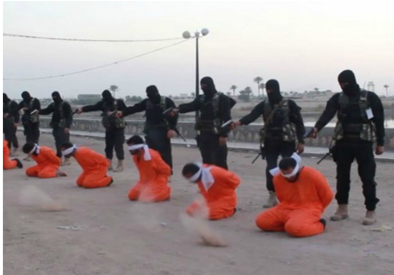
Figure 8. ISIS conducting an execution

An image of ISIS members executing Yazidi prisoners.