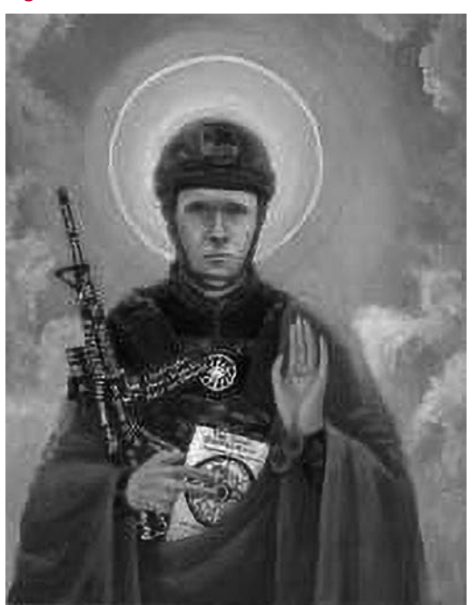
Figure 1: The sanctification of a shooter

Each of the attackers appears to have tried to emulate the virality of Tarrant's manifesto and live stream, although none had the same success. The two American perpetrators posted manifestos to 8chan, both of which directly cited Tarrant as an inspiration. By the time of the attack in Halle, Germany, the 8chan forum had been taken down (although it's since been revived as 8kun), so instead the attacker posted his links to an obscure forum loosely affiliated with 4chan.<sup>12</sup> His manifesto contained direct references to 8chan.