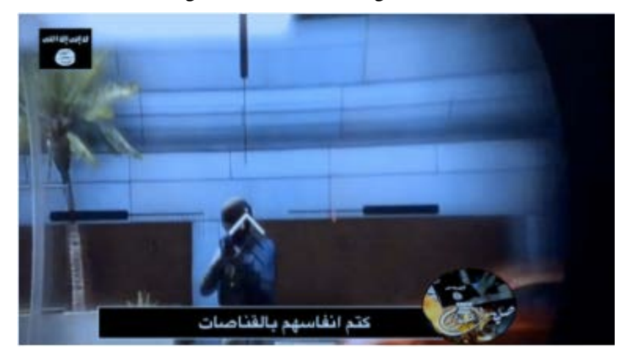
Figure 9. ISIS video game