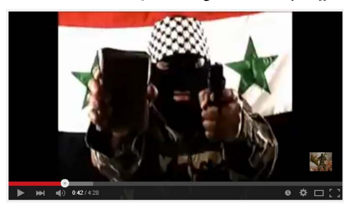
Screen capture taken from the Dirty Kuffar video.