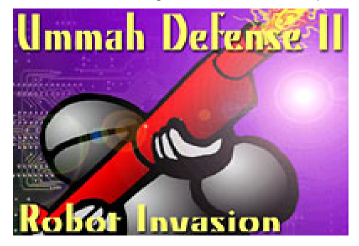
Figure 7. Al Qaeda video game entitled Ummah Defense II