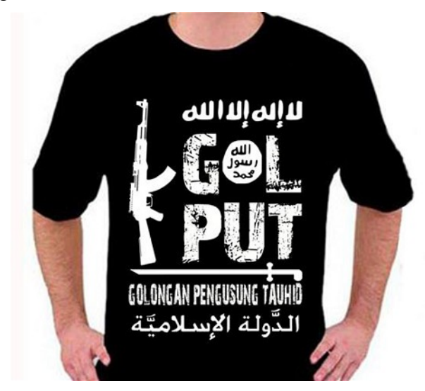
Figure 1. ISIS T-shirt once sold on Facebook

Caliphate) before it was shut down.<sup>96</sup> In 2014, Facebook users could buy various ISIS souvenirs such as toys or clothes. Figure 1 is an example of clothing that was available to Facebook users before administrators removed the site.<sup>97</sup>