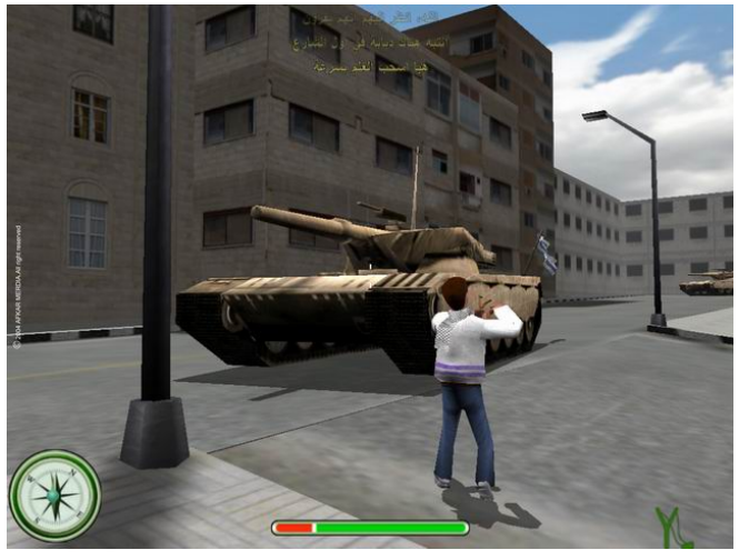
Screen capture taken from the Under Ash 2 video game. Image is available to view on the game download page.