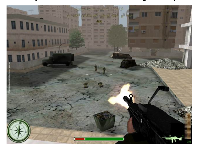
Screen capture taken from the Under Ash 2 video game. The image is available to view on the game download page.

Figure 4. Player from Under Ash assaulting military forces