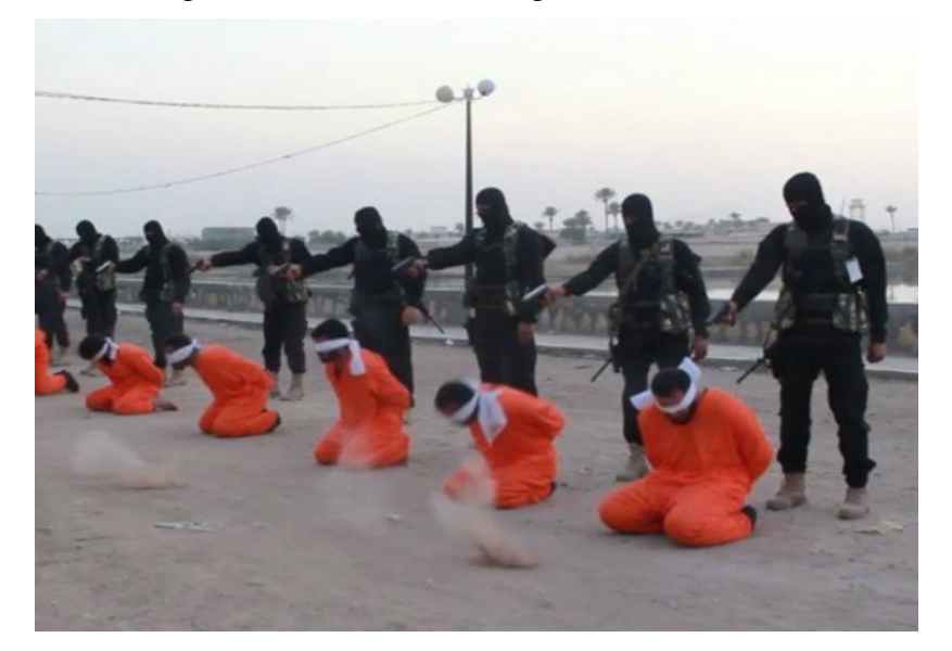
Figure 8. ISIS conducting an execution

intimidate viewers and governments. It telegraphs that any opposition will face a violent and similar fate to that of the Yazidis.<sup>178</sup>