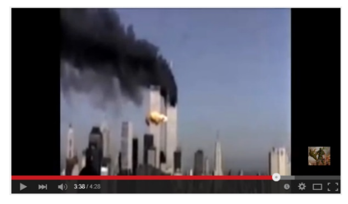
Screen capture taken from the Dirty Kuffar video.

In 2010, approximately 750 Anwar al-Awlaki videos were posted on YouTube.<sup>104</sup> These videos contained violent themes and inflammatory rhetoric. Online viewers watched these 750 videos 3.5 million times before accounts that hosted the videos were disabled. Before the videos were removed from YouTube, Major Nidal Hasan, a U.S. Army officer, reportedly watched several videos and corresponded with Al-Awlaki prior to killing 13 people and injuring several others in the 2009 Fort Hood shooting.<sup>105</sup>