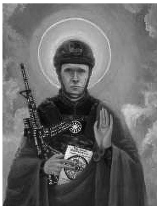
Figure 1: The sanctification of a shooter

Anonymous (ID: [REDACTED]) [REDACTED] (00011)(Wed)1:35:35 No.231563335 ▶ >>211563119 >>211563203 File: 15564132487157.jpg (46 KB, 587x458)